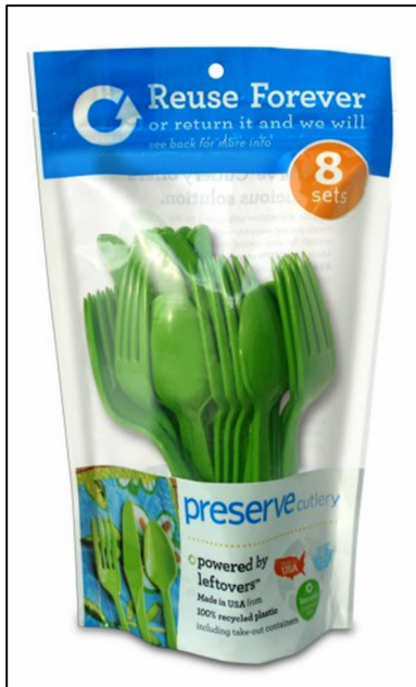
Figure 3: Polypropylene Plastic Cutlery Product