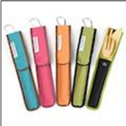
Figure 2: Bamboo Cutlery Product

Social impacts that the products might have on students and consumers at UBC who use this product were also considered. It is expected that students will find the set to be visually appealing and unique as the sets come in a variety (9) different colours. In terms of portability, the set comes with a carabineer that enables the case to be clipped to any backpack or bag.