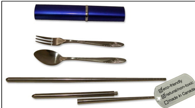
Figure 4: Stainless Steel Cutlery Product

Canada, it does not benefit our economy to the level that a Canadian made product would, and may involve controversial employment practices.